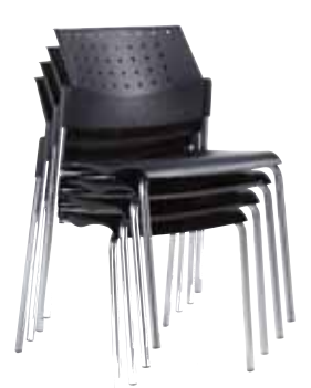
Sonic chairs can stack five high on floor or 10 high on sonic's dolly.