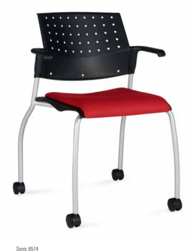
Selected models are available with casters

Sonic 6514 Frames are standard in Chrome and optional in Black, Tungsten and Charcoal