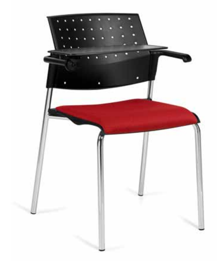
6514T (R) Sonic with Tablet Tablet arms, left or right handed, are available on most Sonic chairs

Contemporary and affordable stacking chairs