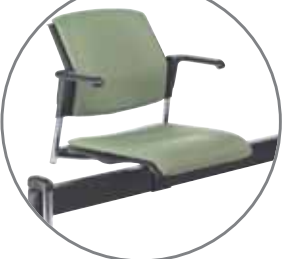
Upholstered seat and upholstered pad on black polypropylene back

Upholstered seat with polypropylene back