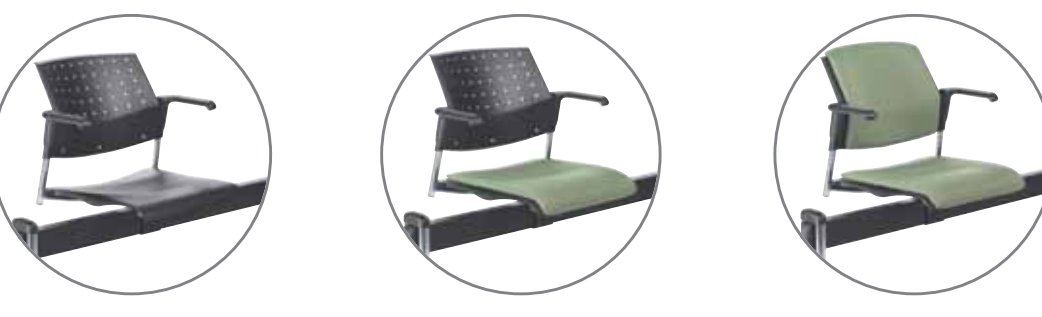
Polypropylene seat and back

Upholstered seat with polypropylene back