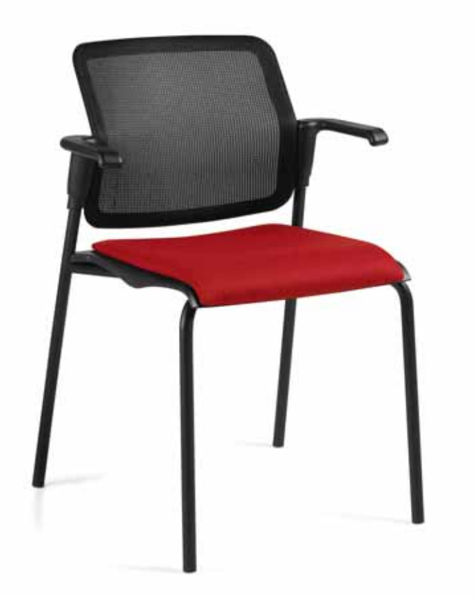
6514MB Sonic Mesh All Sonic models are available with Black mesh backs