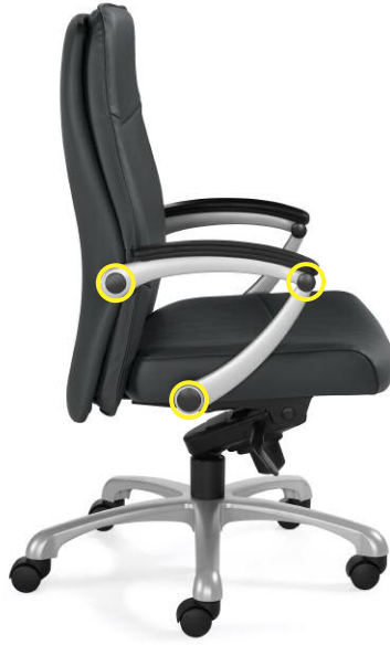
3612-2 Flexar High Back Synchro Knee-Tilter

Sophisticated arm pivots at three points to allow smooth, synchronized seat and back movement