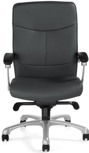
3612-2 Flexar High Back Synchro Knee-Tilter