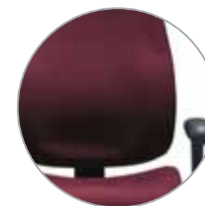
Lumbar Support - is height adjustable and can be positioned to provide the right fit and comfort.