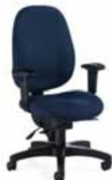
2436-1 - High Back Synchro-tilter with 3M arms and seat slider.