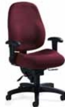
2432-16 (TD) - High Back Synchro-Tilter with TD arms, and seat slider