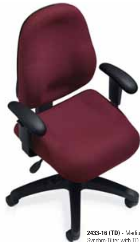
2433-16 (TD) - Medium Back Synchro-Tilter with TD arms

This state-of-the-art multi-shift, intensive use seating is designed with a wide range of adjustment possibilities. Rated at a 350lb. weight capacity and featuring a high-density molded seat and back foam, Dexter and Dexter Plus models accommodate users who prefer extra room and long lasting comfort. Select from the multiple adjustments to make your chair fit and support you perfectly throughout your workday.