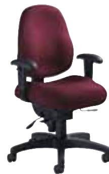
2433-16 (TD) - Medium Back Synchro-Tilter with TD arms and seat slider.