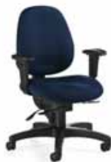
2437-1 - Medium Back Synchro-Tilter with 3M arms and seat slider.