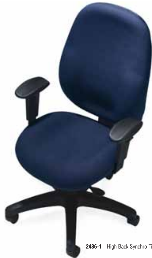
2436-1 - High Back Synchro-Tilter