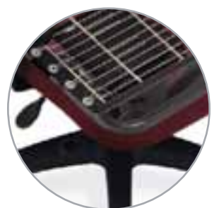
Seat Structure - heavy duty 14" steel tube seat frame with Perma-Mesh™ seat suspension, provides superior comfort.