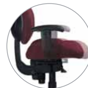
Seat Slider - Offers a 2" adjustment to accommodate tall and short users.