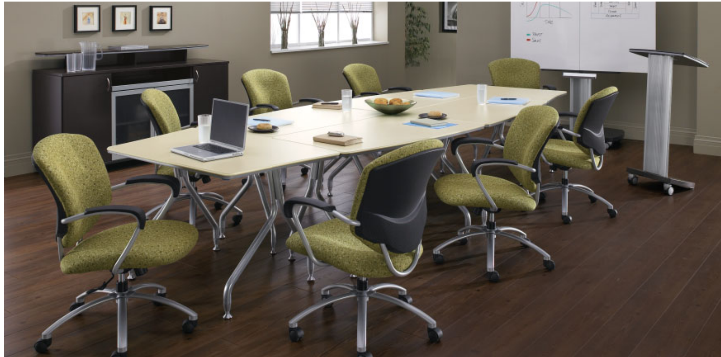
Top: Tables shown in Constellation Vanilla (CSV) with Silver legs (SI) and trim, Lectern, Presentation Board, and Credenza Buffet shown in Constellation Java (CSJ) with Silver legs (SI) and trim. Shown with Supra seating.