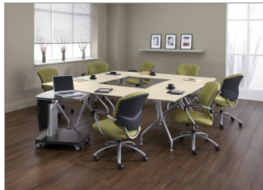
Right Detail: Tables shown in Constellation Vanilla (CSV) with Silver legs (SI) and trim. Presentation Board shown in Constellation Java (CSJ) with Silver legs (SI) and trim. Shown with Supra seating.