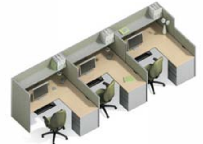
Customer Service Workstations shown with bookshelf

66" panel configurations allow the user to build private or semi-private offices for executive, management and reception areas that maintain privacy.