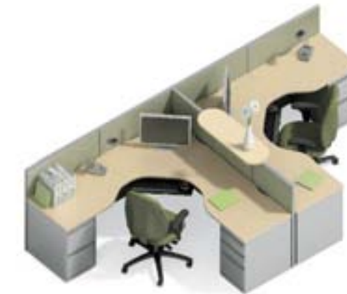
Collaborative Workstation shown with transaction top

A versatile product with many small office applications.