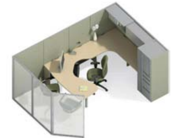
Management Workstation with frosted panel for privacy