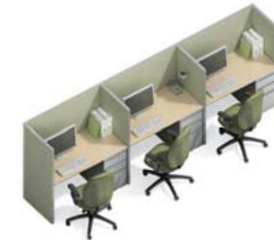
Telemarketing Workstation with a pedestal supported worksurface