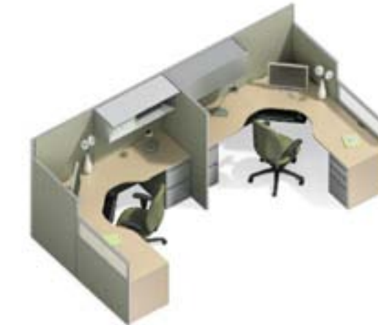
Double Clerical Workstation shown with overhead storage