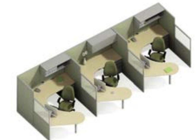
Travel Agent Workstations

Panels and ergonomically designed worksurfaces are configured to provide ample space and privacy for individual tasks in an open office while facilitating occasional group interaction.