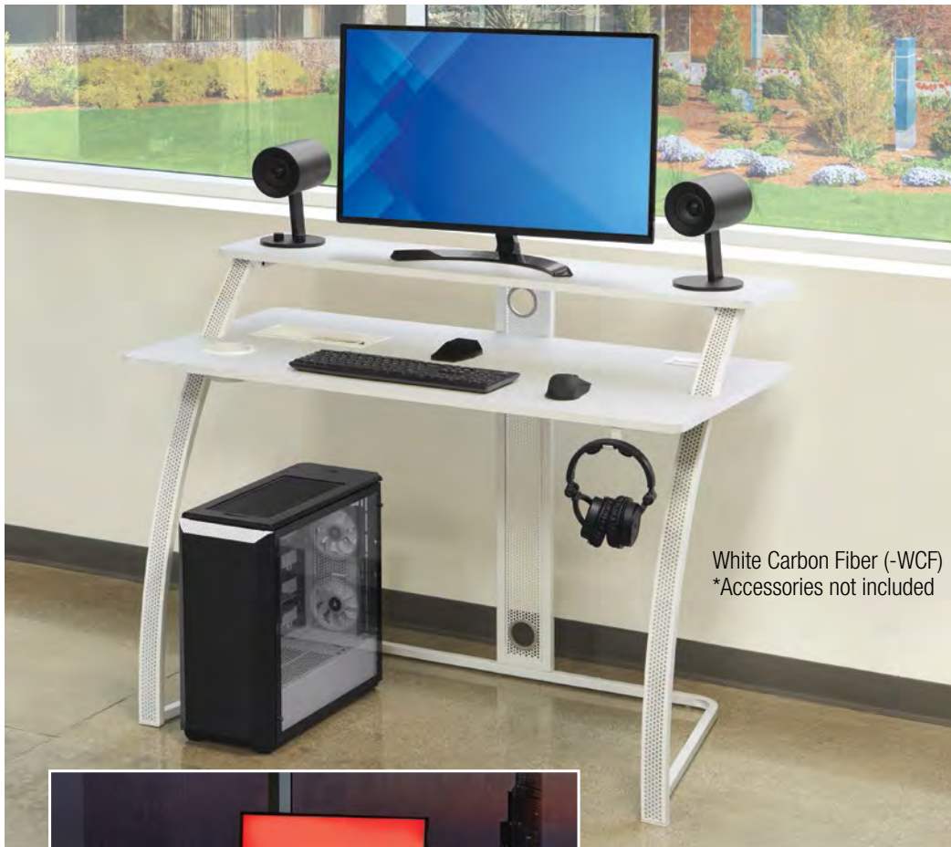
White Carbon Fiber (-WCF) *Accessories not included