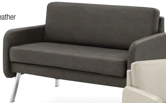
Smoke Faux Leather (-P52)