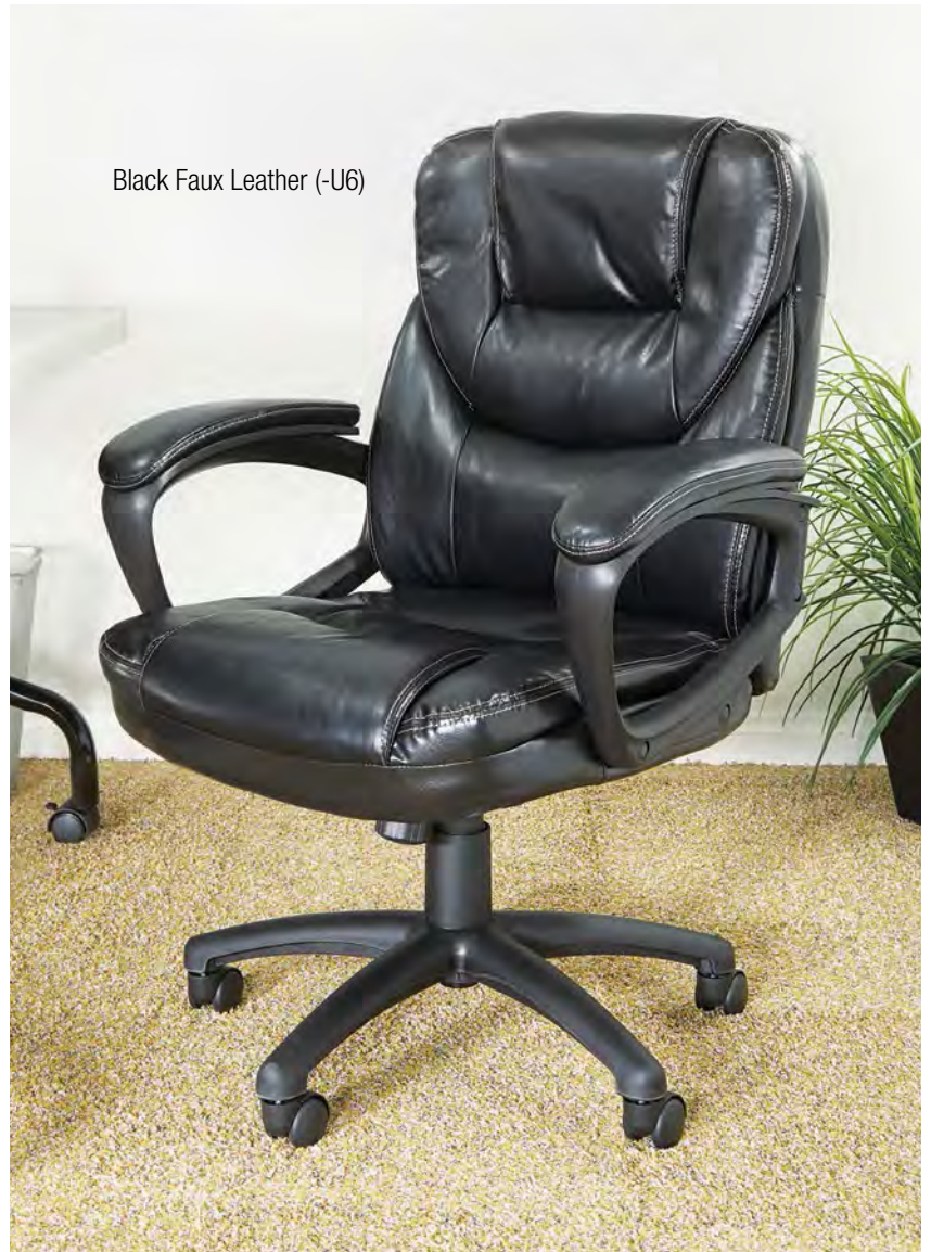
Black Faux Leather (-U6)