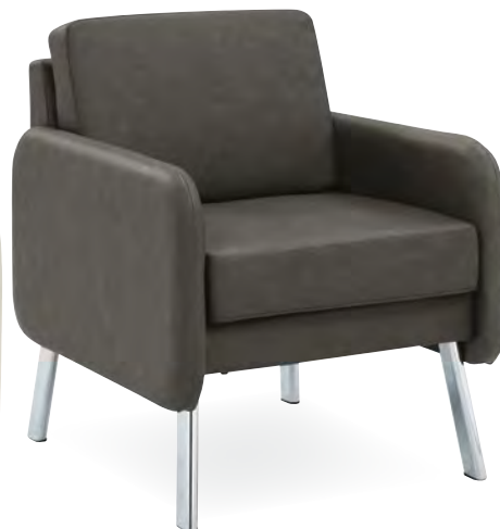
Smoke Faux Leather (-P52)