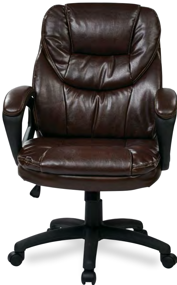
Chocolate Faux Leather (-U2)