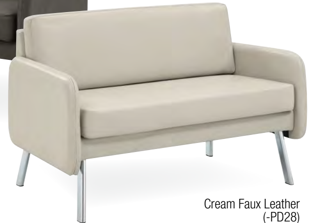
Cream Faux Leather (-PD28)