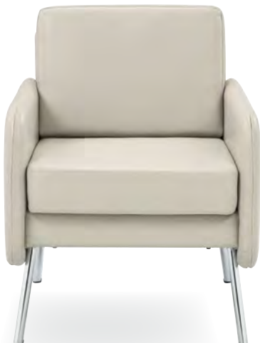
Cream Faux Leather (-PD28)