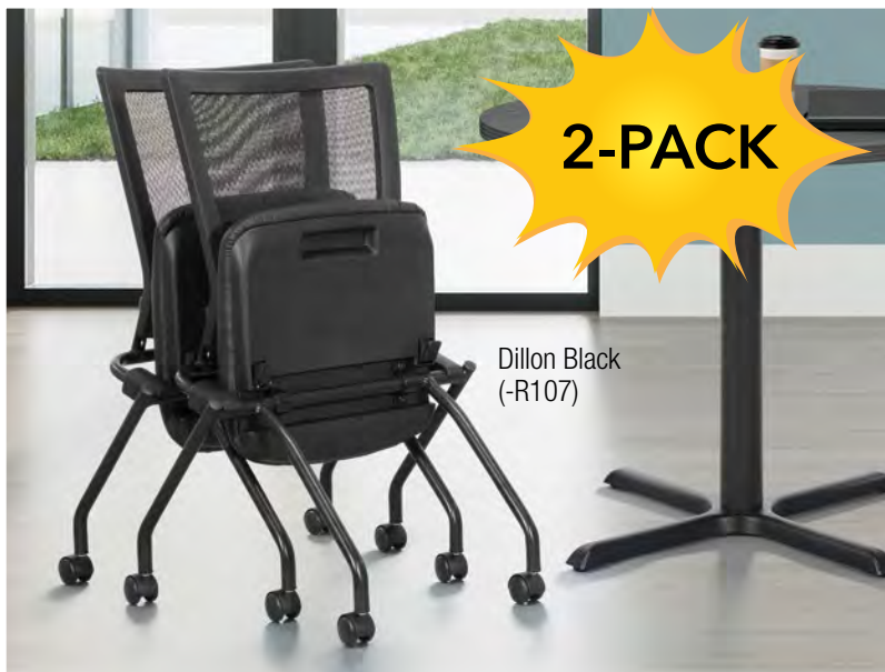
Dillon Black (-R107)