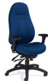
Obusforme™ Plush High Back Multi-Tilter with Schukra