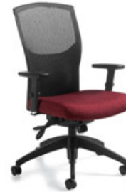
KALEROL High Back Tilter with mesh back