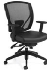
BEXUS Multi-Tilter with Air-flow mesh back.