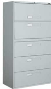
CENTRE PULL DESIGN