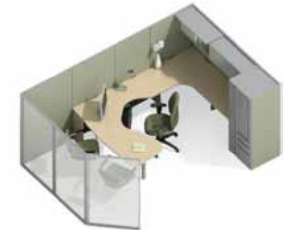
Management Workstation with frosted panel for privacy