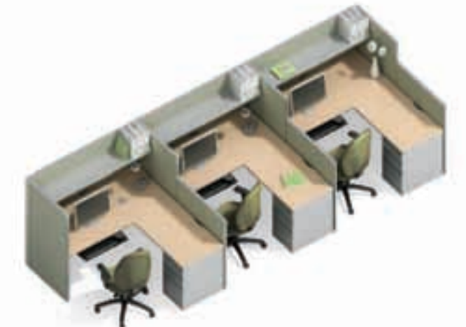
Customer Service Workstations shown with bookshelf

66" panel configurations allow the user to build private or semi-private offices for executive, management and reception areas that maintain privacy.