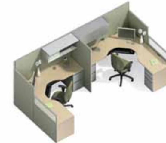
Double Clerical Workstation shown with overhead storage