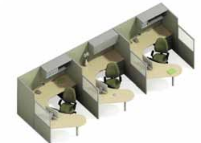
Travel Agent Workstations

Panels and ergonomically designed worksurfaces are configured to provide ample space and privacy for individual tasks in an open office while facilitating occasional group interaction.