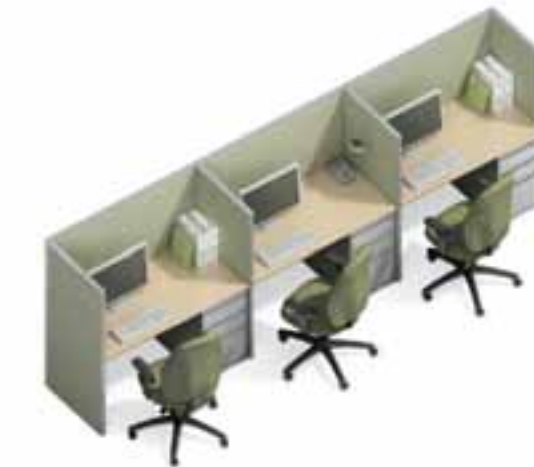
Telemarketing Workstation with a pedestal supported worksurface