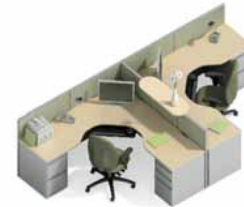
Collaborative Workstation shown with transaction top

A versatile product with many small office applications.