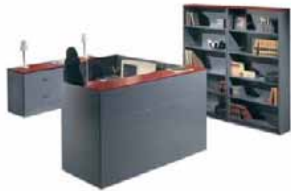
Shown in Avant Cherry (AWC) over Storm Grey (SOG) with NuCAS (right) and ObusForme (above) seating.