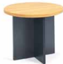
Cross Base shown with a round top

Tiger Maple (TMP) over Storm Grey (SOG).