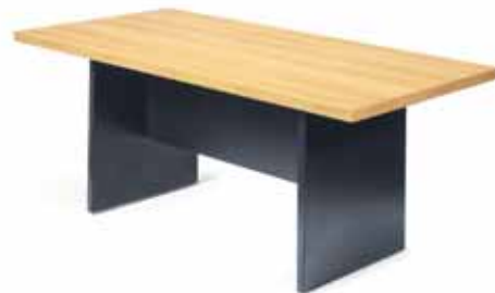
Panel Base shown with a rectangular top

Round, square, rectangular and racetrack table tops can be supported by a variety of base designs.