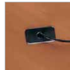
Work Surface grommet / wire pass through