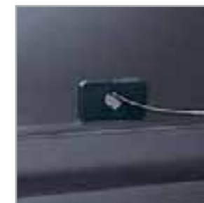
Hutch back panel has grommet / wire pass through at top