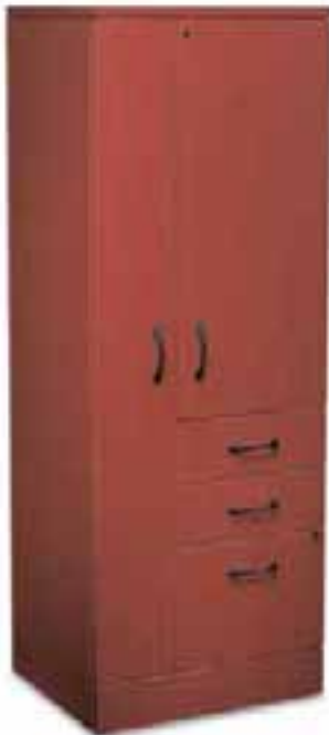
Personal Storage Tower