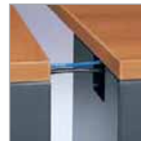
Narrow Support Legs with wire support pass through

Electrical and data wiring easily passes through Adaptabilities notched end panels, grommets and flexible wire ways in hutches.