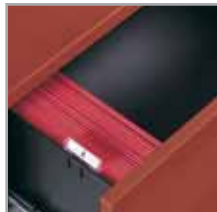
Fully progressive steel ball bearing suspension