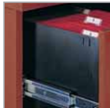
Steel drawer interior