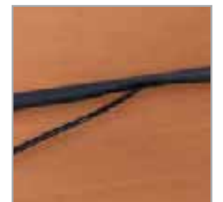
Hutch - Soft wire way for cable management at bottom